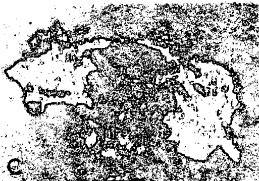
Fig. 1. Squash preparation of garlic root-tips 24 hr. after 5 min. of exposure in the electromagnetic field. A, Resting stage of an irradiated cell showing two nuclei linked by a chromatic bridge and no cytodieresis; B, metaphase with linear shortening of chromosomes; C, bridging