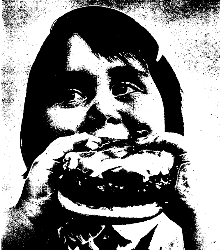
HER CHILDHOOD EATING HABITS WILL DETERMINE HER ADULT WEIGHT.

Many of the Italian workers have refused to work in the factory which uses the "anti-sex machines."